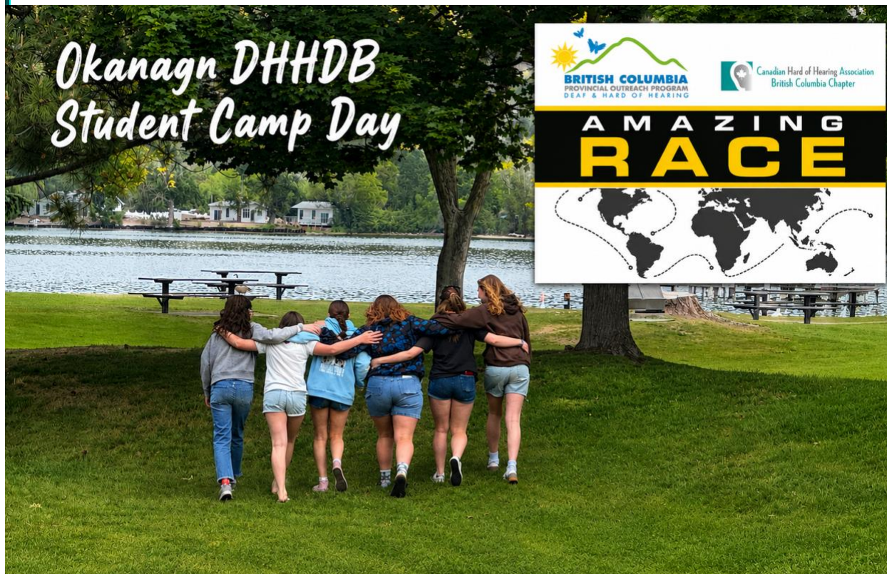
Okanagan DHHDB Student Camp Day poster