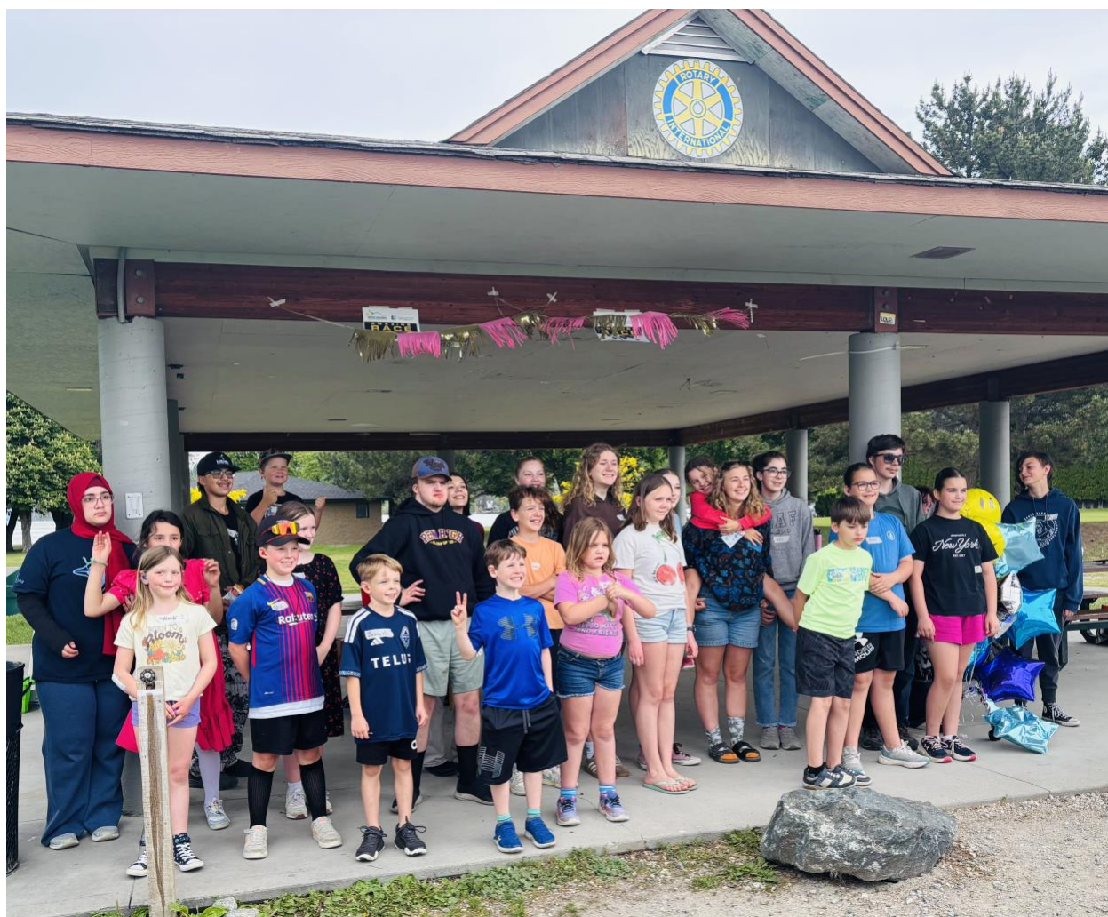
Attendants at Okanagan DHHDB Student Camp Day

Creating safe and inclusive DHHDB events are key to building community and student identity. A heartfelt thank you to CHHA-BC and British Columbia Provincial Outreach Program Deaf Hard of Hearing (POPDHH) for their generous financial donations and to PDHHS, POPDB and SD 22's indigenous education department for their support in making this meaningful and memorable day possible.