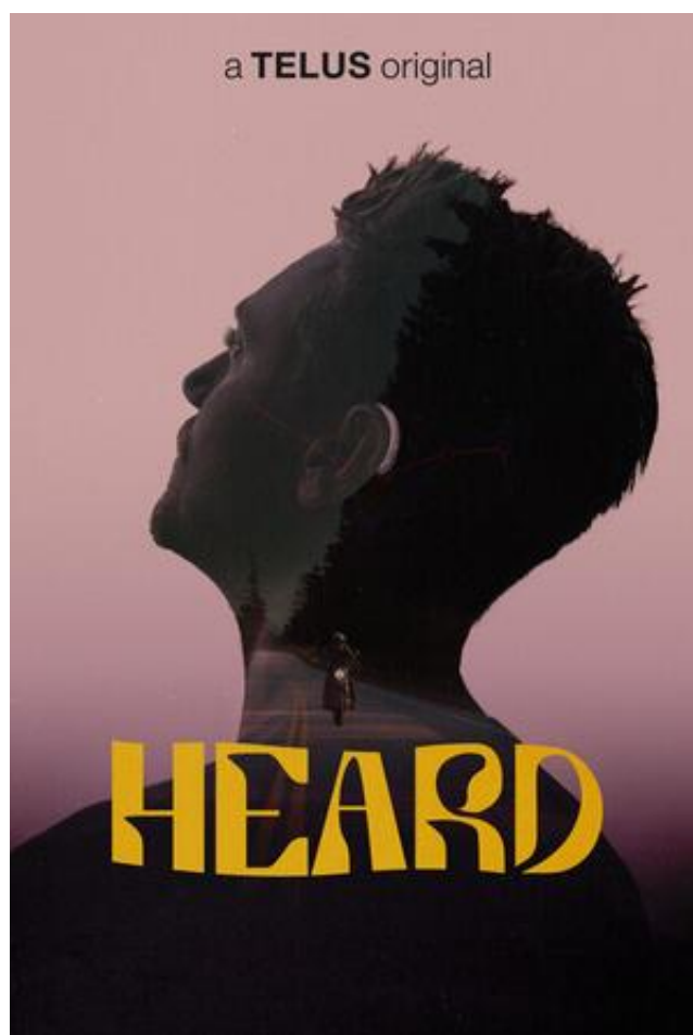
Bottom: HEARD movie poster.