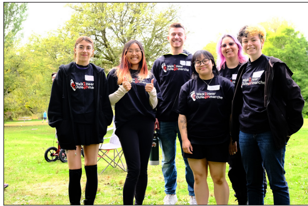
Many thanks to our Walk2Hear event volunteers!