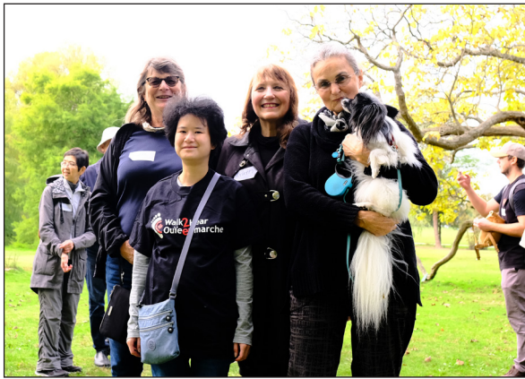
Congratulations to the draw prize winners!